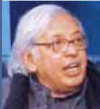
Ashok Vajpeyi Eminent Poet & Art Critic