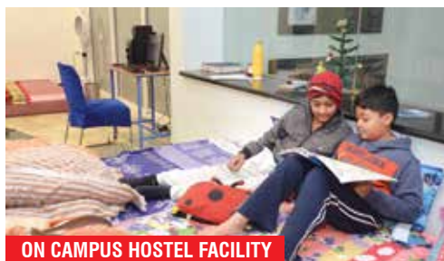
ON CAMPUS HOSTEL FACILITY