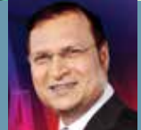
Shri Rajat Sharma Senior Journalist India TV